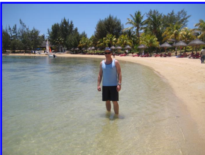
Our private beach at Legends Resort

The 5 star Legends Resort was hard to fault. Just like Beau Rivage, the food was amazing, and the beachfront location was as close to paradise as you could get. The resort wrapped itself around a couple of lagoons, and along with 4 pools, it gave you a sense of privacy as most guests spread themselves around the various bathing areas, thus never seeming to be overcrowded.