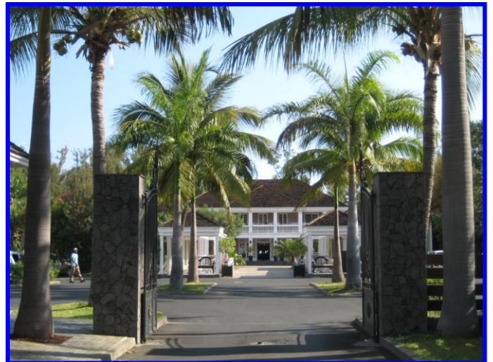
The entrance to Grand Hotel du Lagon, Reunion

After our 2 night Reunion stopover it was a quick 45 minute flight on to Mauritius. Our transfer from the airport, located down the south end of the island, to our resort which was located in Bell Mare on the east coast, only took 50 minutes. Our first 3 nights spent at the 5 star Beau Rivage was amazing! The weather, location and food could not be faulted. We mainly spent our time lazing by the pool/beach, waterskiing, eating and visiting local markets.