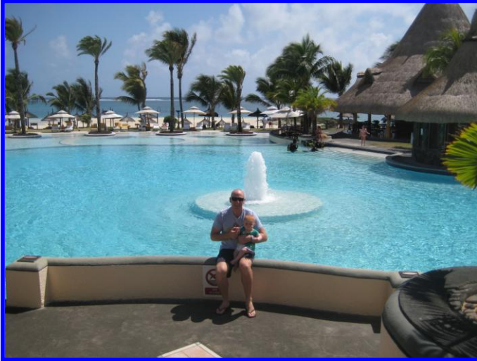
The pool area at Beau Rivage, Mauritius.

Many people have a belief that Mauritius is an expensive destination. The initial 'package price' will of course be more than a Fiji or Thailand package, but many people don't realise most resorts in Mauritius include at least breakfast and dinner (with options to include lunch). Other activities such as waterskiing are also included at most resorts, so we found that once we arrived we actually didn't spend much money at all.