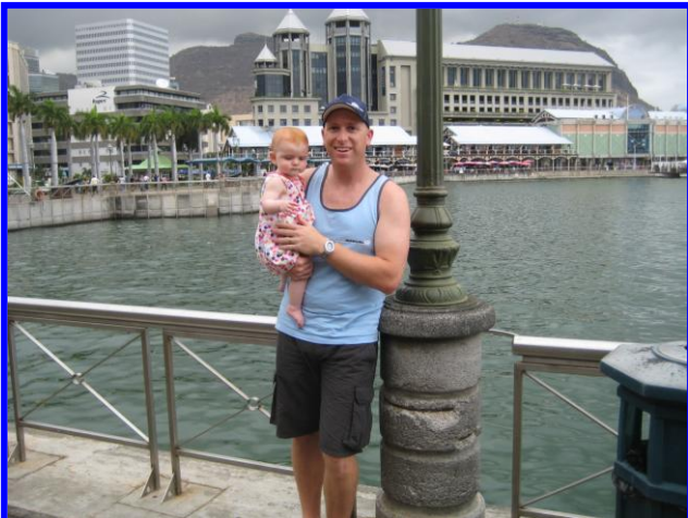
The modernised Port Louis Waterfront

The hustle and bussle of the Port Louis markets. Well worth it to pick up some souvenirs and genuine brand garments such as Guess, Abercrombie & Fitch, Calvin Klein, Prada etc.