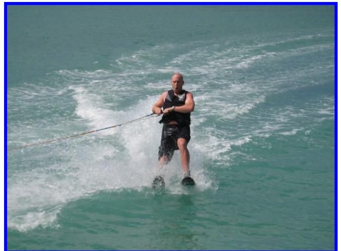
Motorised activities such as waterskiing are complimentary

I would highly recommend hiring a car, as it made everything very accessible and was a great way to fill in an hour or two if you had had enough sun for the day! I was surprised at how easy and quick it was to get around the island, it only took me 1 hour to drive from north to south, on the motorway. Some roads are a bit second rate, but as long as you take your time and have a good map, you should find driving in Mauritius stress free.